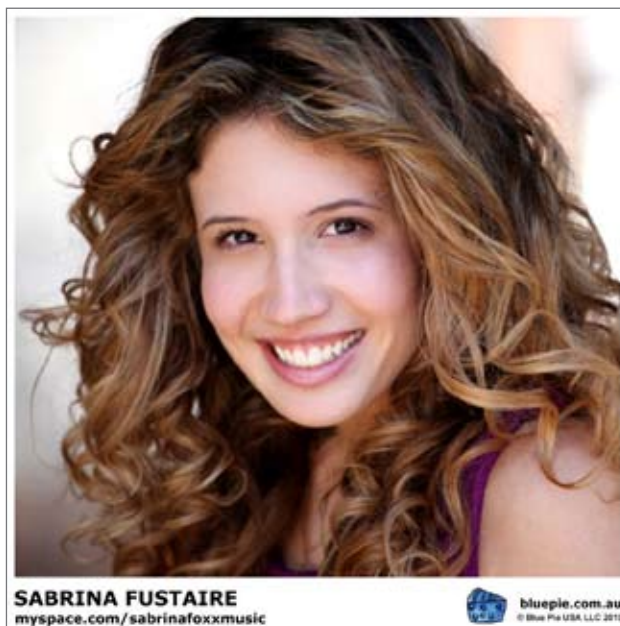
COMP CARD #10

By signing this approval the customer hereby grants creative license for Blue Pie to select colour schemes when and where appropriate for all approved artwork, print media and digital requirements.