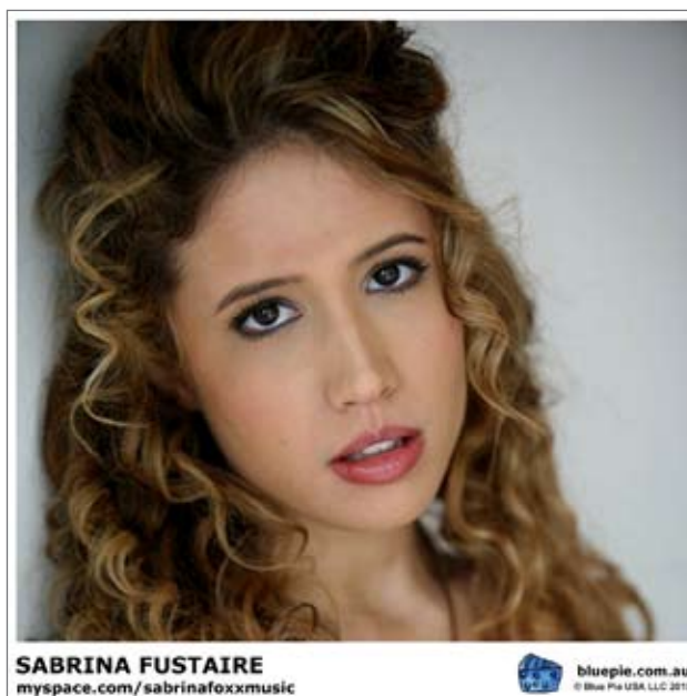
COMP CARD #8

By signing this approval the customer hereby grants creative license for Blue Pie to select colour schemes when and where appropriate for all approved artwork, print media and digital requirements.