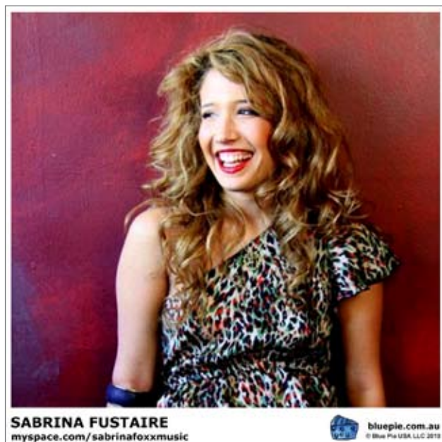
COMP CARD #5