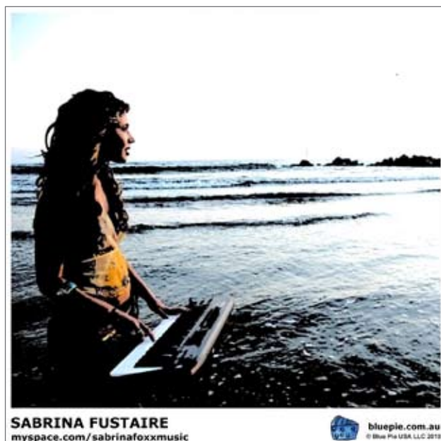
COMP CARD #3