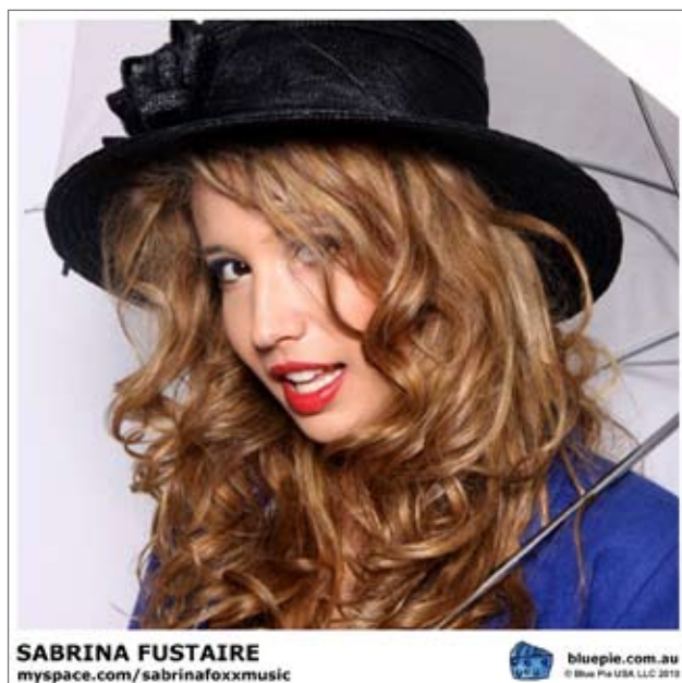
COMP CARD #7