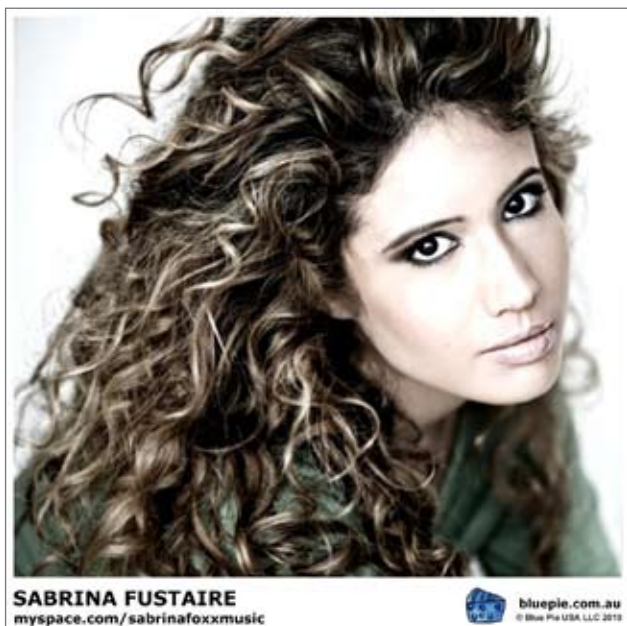
COMP CARD #9