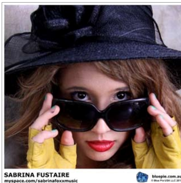
COMP CARD #6