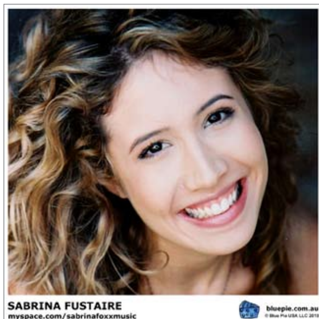
COMP CARD #1