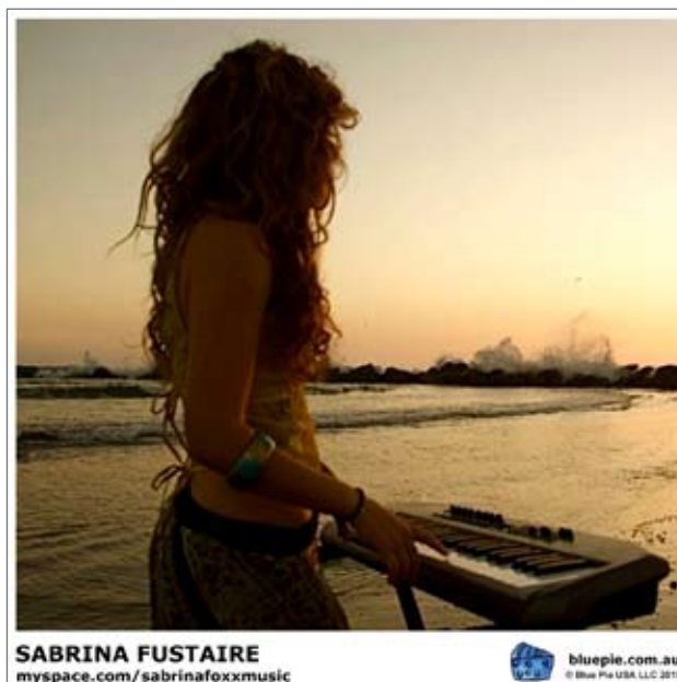
COMP CARD #2