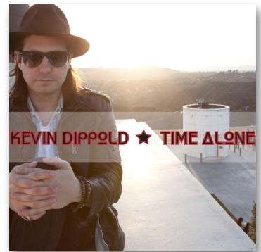
KEVIN DIPPOLD ★ TIME ALONE